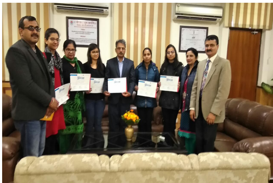
The participants of the camp with the Vice- Chancellor and DSW, KU

vii) Nukkad Natak on Respecting the Dignity of Women: Youth Red Cross (UTD) in collaboration with YUVA and SEWA foundations jointly organized a Nukkad Natak on the theme 'Beti Bachhao, Beti Paddao: Respecting the Dignity of Women' on