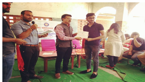
DSW felicitate the blood donor