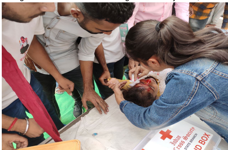
YRC Volunteers providing First Aid at YRC First Aid Post