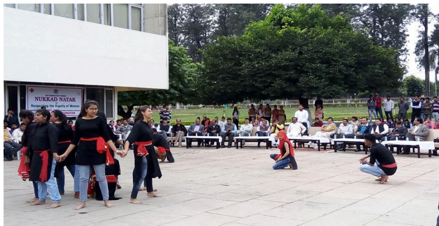
Performing the Natak