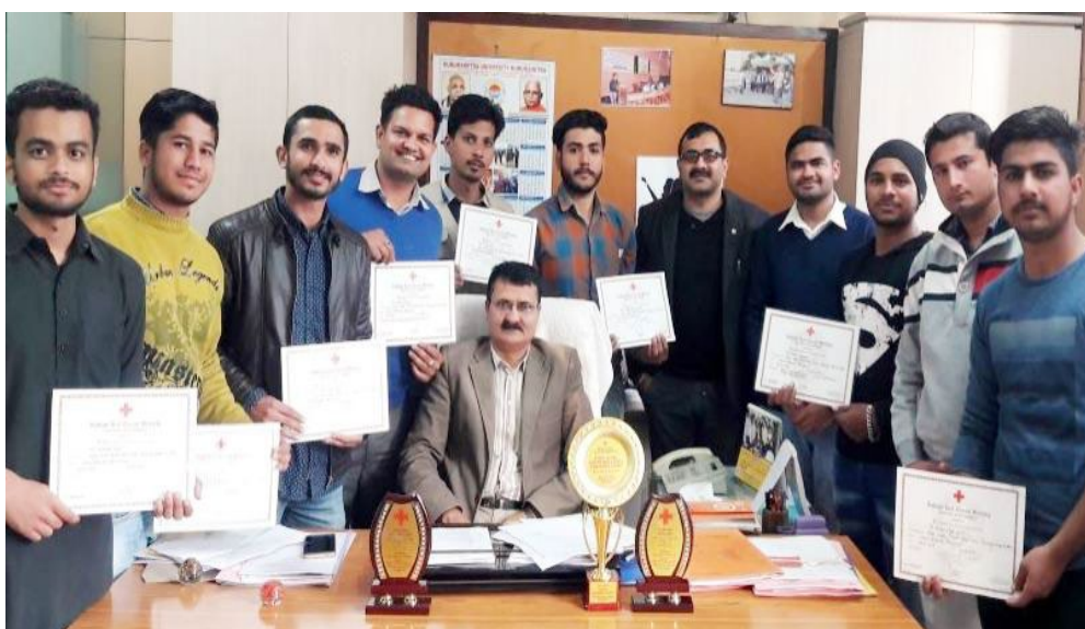
The participants of the camp with Dean Students' Welfare and Programme Counsellor