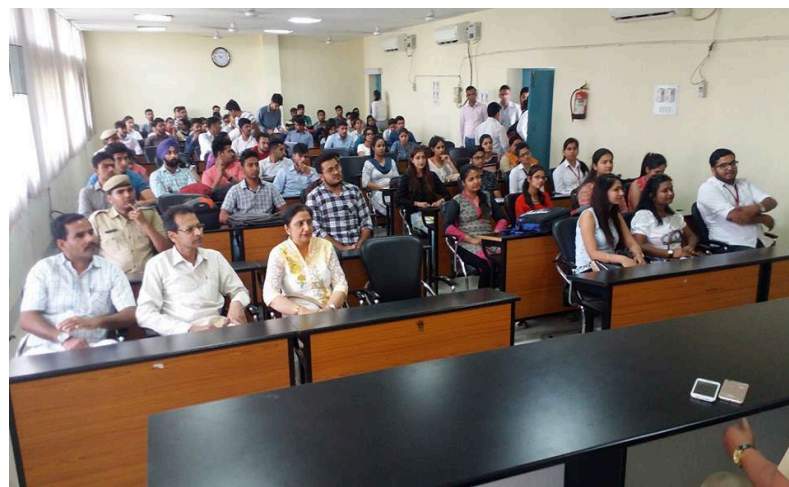
The participants of the programme