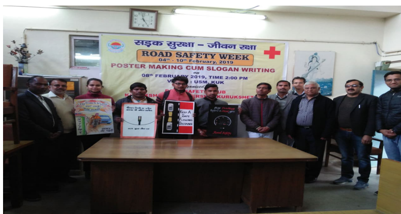
The winners of Slogan Writing Competition