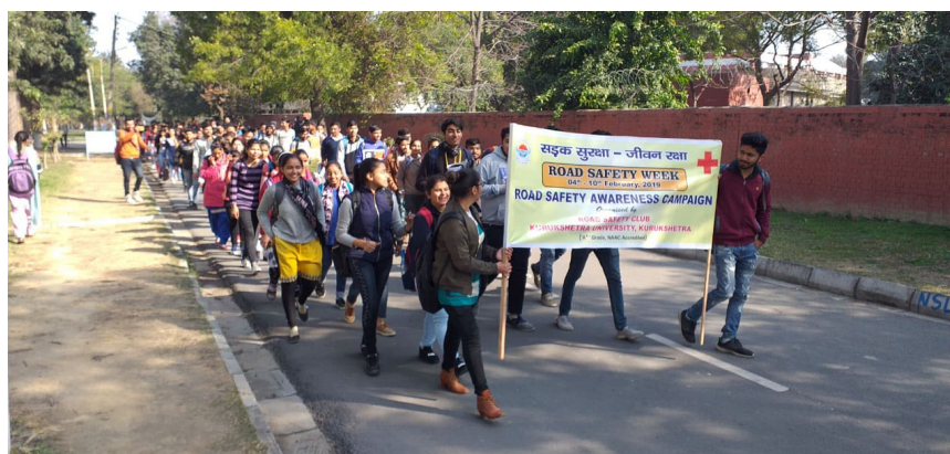
The volunteers in action