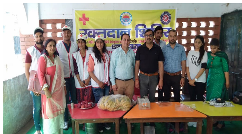
Distribution of refreshment in the Camp