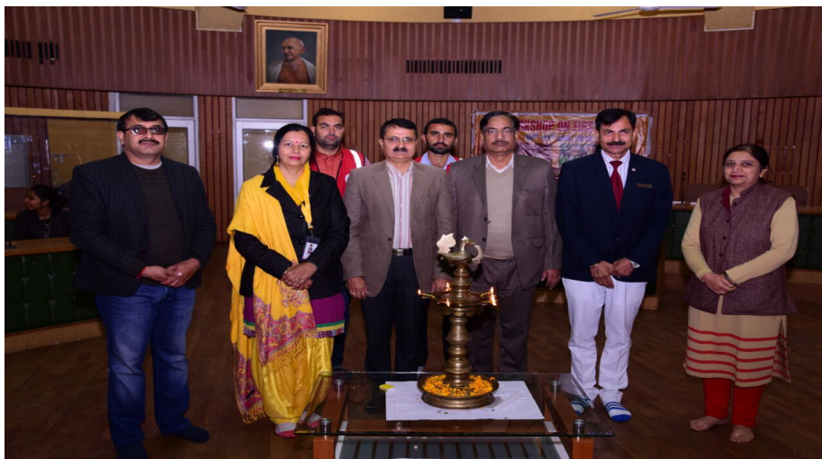
Inauguration of the Programme

In the training programme the students learn the techniques of DR ABC, CPR and vital steps for saving someone's life from heart attack, fracture, accidents etc. The training was provided with demonstration on dummy.