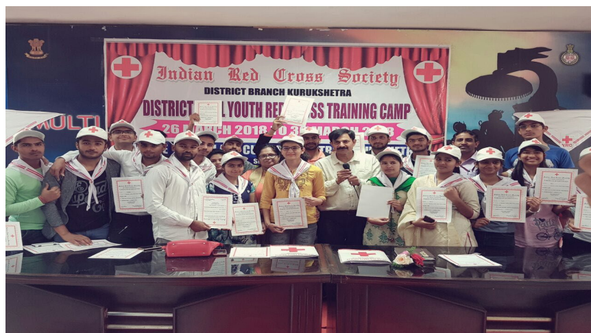
The participants of the camp