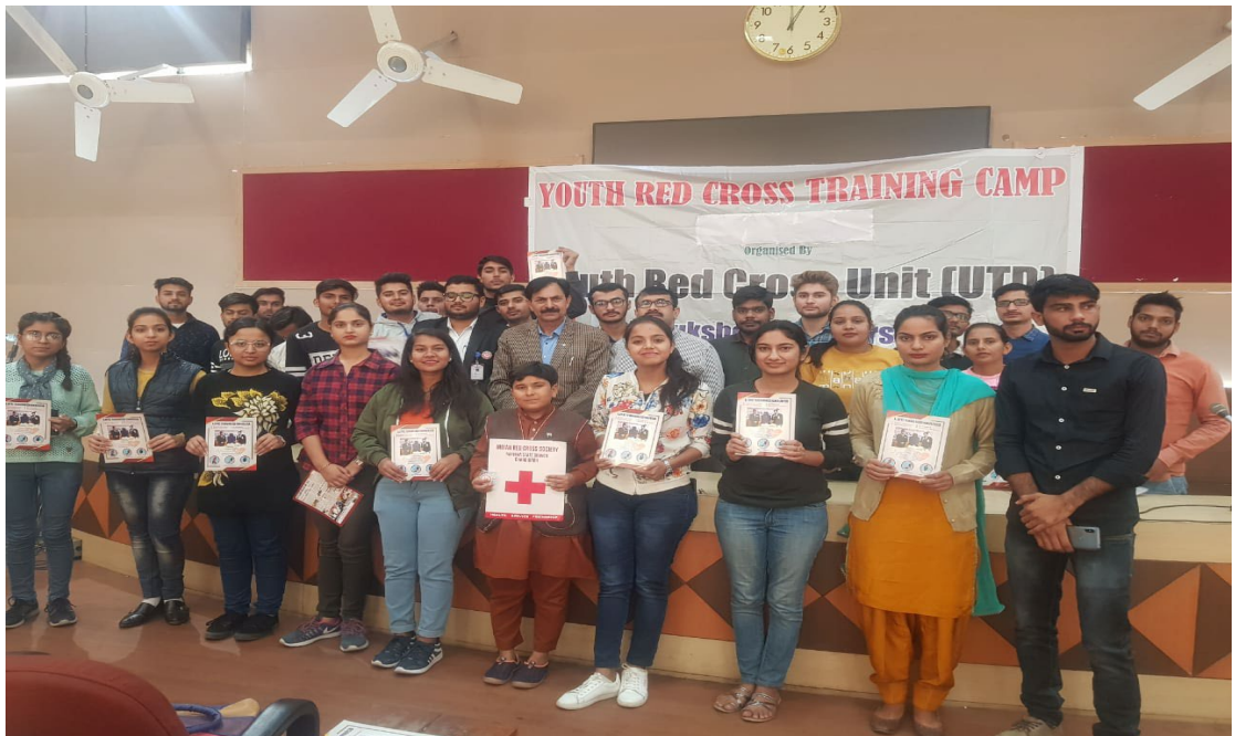
First Aid & Home Nursing Training Camp