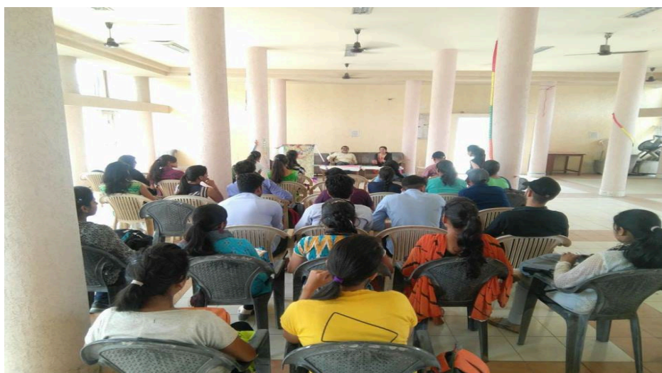
Discussion on the health issues