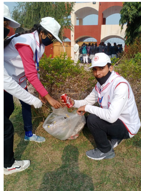
Swachh Bharat Abhiyan