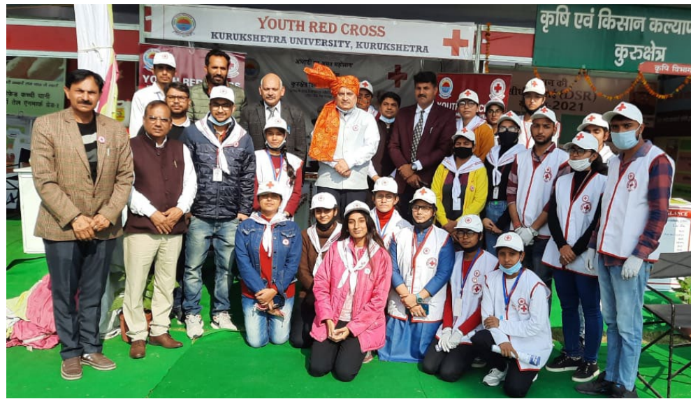
Hon'ble Vice-Chancellor at First Aid Post and Youth Red Cross Stall