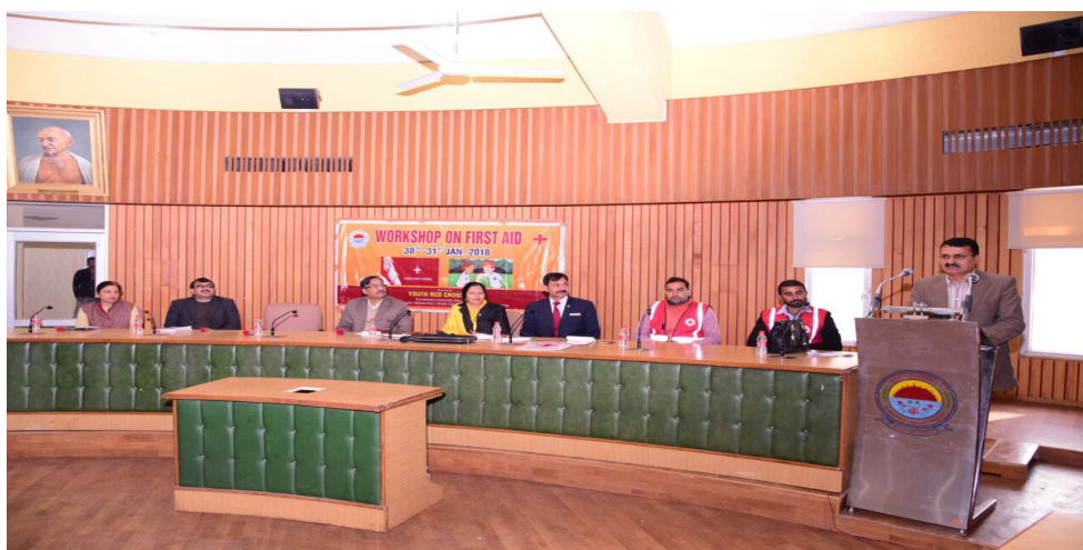
Dean Students' Welfare addressing the participants

ii) World Dietetic Day- Youth Red Cross in collaboration with Department of Home Science celebrated the National Dietetic Day on 10-11 January, 2018. Healthy Recipe competition and Health Awareness camp was organized to spread awareness about healthy and nutritious recipes to improve the nutrition level of women at different stages of life. Ten teams consisting of two students in each team participated in the competition.