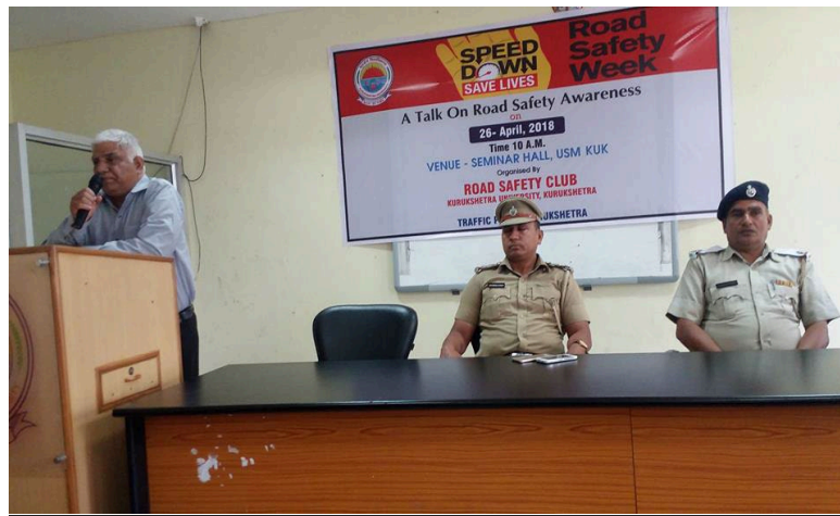
The Staff of Traffic Police