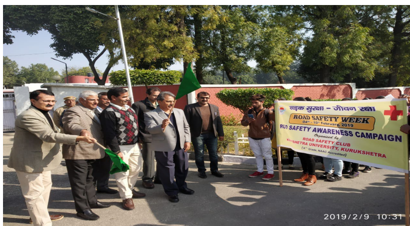
The rally was flag off by the Vice- Chancellor, KUK

On the observation of 30th National Road Safety Week 2019 from 4th to 10th Feb, 2019, Youth Red Cross UTD Kurukshetra University, Kurukshetra in association with Road Safety Club, K.U.K. organized an awareness rally on 09.02.2019 in which around 200 students from various Departments participated.