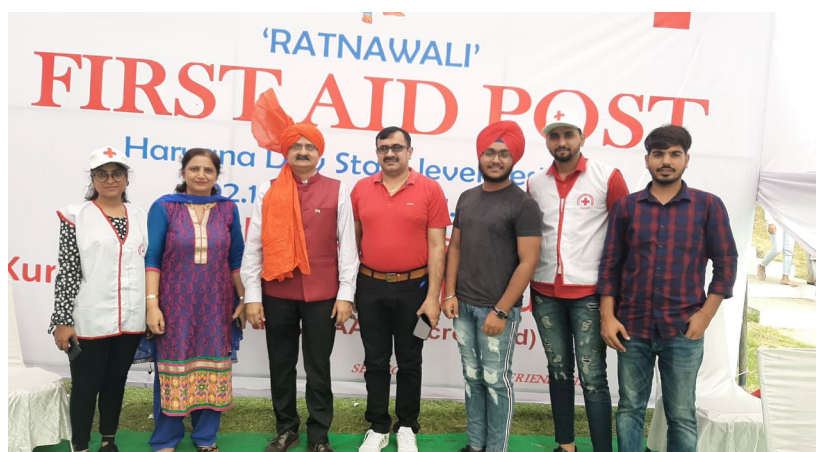
Inauguration of First Aid Post during Ratnawali by DSW, K.U.K.