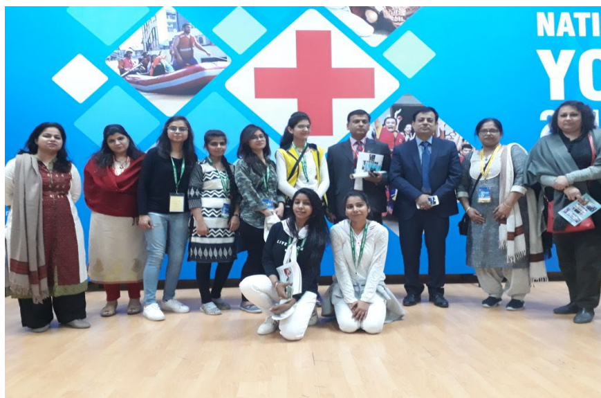
The participants of the camp with the organizers