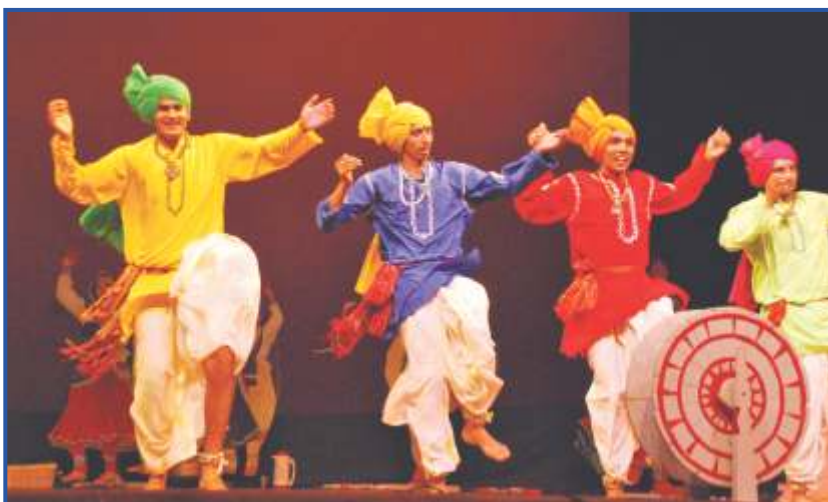
राज्य स्तरीय हरियाणा दिवस समारोह रत्नावली के दौरान प्रस्तुति देते हुए छात्र कलाकार

विश्वविद्यालय परिसर के उत्कृष्टता चिहनों में से एक है इसकी प्राकृतिक सुंदरता तथा परिवेश। विद्यार्थियों की बढ़ी संख्या द्वारा स्थान की बढ़ती हुई मांग से विश्वविद्यालय ने सामना किया और उसी समय स्वयं को प्राकृतिक परिवेश के परिरक्षण के लिए वचनबद्ध कर दिया। देश में इसे सम्भवतः प्रथम तथा जंतु समूह की प्रजनन प्रक्रिया को सुनिश्चित करने हेतु एक प्राकृतिक वन के रूप में लगभग 40 एकड़ के क्षेत्र की अनुरक्षित करने का प्रस्ताव पारित किया। विश्वविद्यालय को वर्ल्ड मैनेजमेंट कांग्रेस, नई दिल्ली द्वारा ग्रीन कैम्पस ऑफ द ईयर 2010 अवार्ड से भी सम्मानित किया गया।