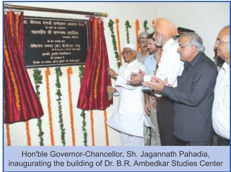
Hon'ble Governor-Chancellor, Sh. Jagannath Pahadia, inaugurating the building of Dr. B.R. Ambedkar Studies Center

The Department Sanskrit collaborated with the Manuscripts Resource & Conservation Centre in organizing an International Seminar on "Tantra : An Exploration of the Esoteric Knowledge Traditions in Manuscripts & Exposition of the Evolution and Cross-currents of Ideas" sponsored by National Mission for Manuscripts, Ministry of Culture, Govt. of India on 28-31 March 2013.