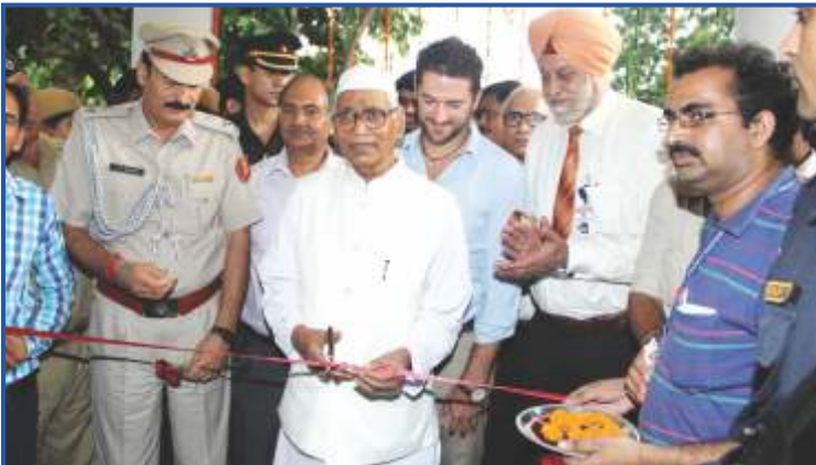
माननीय राज्यपाल एवं कुलाधिपति श्री जगन्नाथ पहाड़िया स्वामी विवेकानन्द पुरुष छात्रावास का उद्घाटन करते हुए।

परिसर पर 10 संकायों में कुल 46 विभाग हैं जो व्यवसायिक, अन्तर्विषयी तथा पारम्परिक पाठ्यक्रमों का एक मिश्रण प्रदान करते हैं। उदीयमान क्षेत्रों में नये कार्यक्रम यथा डिफेंस स्टडिज, नैनो साइन्स एण्ड टेक्नॉलॉजी, जीनोमिक्स, इंटरनेट जर्नलिज्म, इण्टरनेशनल हास्पिटैलिटी बिजनेस मैनेजमेंट, वुमैन स्टडीज, फोरेन्सिक साइन्स, मेनेजमेंट ऑफ डेवलपमेंट एण्ड वेलफेयर सर्विसेज, माइक्रोइलेक्ट्रॉनिक्स एण्ड वीएलएसआई डिजाइन, प्रिन्टिंग, ग्रॉफिक्स एण्ड पैकेजिंग, मल्टीमीडिया आदि प्रशिक्षुओं को प्रदान करने हेतु पाठ्यक्रमों की सूची में जोड़ा गया है। विश्वविद्यालय ने अभी कुछ समय पूर्व अनेक समाकलित के साथ साथ अन्तर्विषयी पाठ्यक्रमों को समाविष्ट किया है। लिंग समानता, जनसंख्या नियन्त्रण, सामाजिक न्याय, परिवेशीय संरक्षण जैसे मुद्दों पर पाठ्यक्रम में एक प्रत्यक्ष प्रतिबल दृष्टिगोचर होता है। इसकी गुण-सम्पोषण तथा संवृद्धि की वचनबद्धता में विश्वविद्यालय शिक्षण-अधिगम तथा मूल्यांकन की