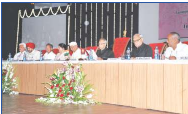
Hon'ble President of India, Sh. Pranab Mukerjee inaugurating a National seminar on Indology

A review of activities on our campus during 2013 confirms the significant advances being made in teaching and learning, and our excellent progress in all our research activities. While there have also been many challenges during 2013, I am confident that we have met and in some instances exceeded many of our objectives in these areas. The University's commitment to its academic endeavours, the hard work of the staff and the passion and loyalty of the students, staff and alumni alike-all contributed to enhance our image as a University of choice for the region's brightest students.