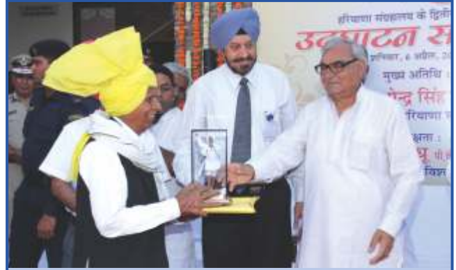
माननीय मुख्यमंत्री श्री भूपेन्द्र सिंह हुड्डा धरोहर भाग-2 के उद्घाटन अवसर पर एक दानी सज्जन को सम्मानित करते हुए

कक्षाओं के अतिरिक्त शैक्षणिक गतिविधियों के अनेक कार्यक्रम, जिसमें व्याख्यान, रिफ्रेश कोर्स, ओरिएंटेशन कोर्स, सेमीनार, कान्फ्रेंस तथा वर्कशॉप शामिल हैं, आयोजित किए गए। इस संक्षिप्त समीक्षा में प्रत्येक कार्यक्रम को बताना संभव नहीं है लेकिन इनमें मुख्यतः भूगोल विभाग द्वारा 4-5 अक्टूबर 2013 को आयोजित अंतर्राष्ट्रीय सैमीनार, इतिहास विभाग द्वारा 14-15 अक्टूबर 2013 को महात्मा ज्योतिबा फुले विषय पर आयोजित दो दिवसीय राष्ट्रीय सैमीनार, 28-31 मार्च 2013 को संस्कृत विभाग द्वारा आयोजित सैमीनार।