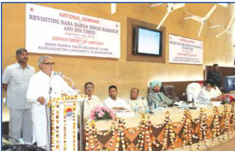
Hon'ble Chief Minister, Sh. Bhupinder Singh Hooda speaking as chief guest at the National Seminar on Baba Banda Singh Bhadur

To broaden the horizons of students and scholars of the University, the flurry of academic activity