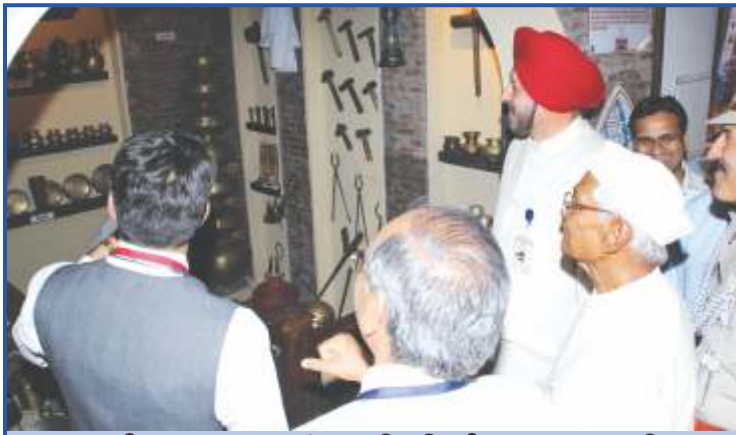
माननीय राज्यपाल एवं कुलाधिपति श्री जगन्नाथ पहाड़िया धरोहर भाग-2 का अवलोकन करते हुए

कुरुक्षेत्र विश्वविद्यालय अपने विद्यार्थियों, कर्मचारियों तथा संकायों के दिन प्रतिदिन बदलती आवश्यकताओं को पूरा करने के लिए भरसक प्रयत्न कर रहा है। वर्ष 2013 के दौरान अनेक बांकागत परियोजनाओं को प्रारम्भ तथा पूर्ण किया गया। माननीय मुख्यमंत्री हरियाणा श्री भूपेन्द्र सिंह हुड्डा द्वारा धरोहर हरियाणा संग्रहालय के द्वितीय चरण का उद्घाटन किया गया। माननीय राज्यपाल-कुलाधिपति श्री जगन्नाथ पहाड़िया द्वारा नवनिर्मित विवेकानंद ब्याज होस्टल तथा डा. बी.आर.अम्बेडकर स्टडी सेंटर का उद्घाटन किया गया। यू.आई.ई.टी.,