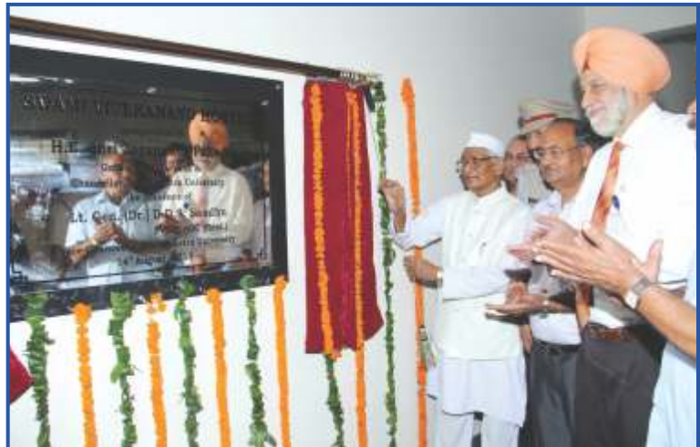
Hon'ble Governor-Chancellor, Sh. Jagannath Pahadia, inaugurating the building of Swami Vivekanand Boys Hostel