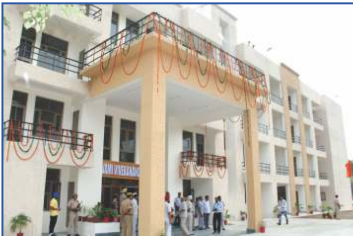
स्वामी विवेकानन्द पुरुष छात्रावास का नवनिर्मित भवन

कुरुक्षेत्र विश्वविद्यालय खेल-कूद में चिह्नित करने के लिए भारत में सर्वोच्च प्रतिष्ठा प्राप्त करने वाले विश्वविद्यालयों की सूची में शामिल है। यह विभिन्न प्रतिस्पर्धाओं में राष्ट्रीय तथा अंतर्राष्ट्रीय स्तरों पर विशिष्टताएं अर्जित कर चुका है। आज विश्वविद्यालय 12 अर्जुन पुरस्कार, 4 द्रोणाचार्य पुरस्कार, 1 मेजर ध्यानचंद पुरस्कार तथा अनेक अन्य राष्ट्रीय तथा अंतर्राष्ट्रीय पुरस्कारों को प्राप्त करने