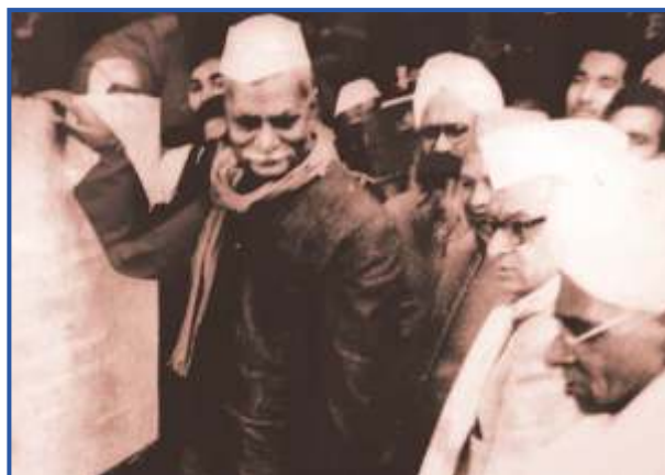
Dr. Rajendra Prasad, the first President of the Indian Republic, laying the foundation stone of Kurukshetra University on 11 th day of January, 1957

The land of Mahabharata and Srimadbhagavadgita witnessed the birth of Kurukshetra University in 1956. Situated on the plains of the river Saraswati on the western bank of the famous Brahm Sarovar, the foundation stone of the University was laid on 11 th January 1957 by the Late Dr. Rajendra Prasad, the first President of India. The University which started with focus on Sanskrit and Indic Studies took a big leap forward in 1961 by transforming its initial unitary character into a multi-faculty university. Today the University has 46 Post Graduate Teaching Departments and Institutes that offer 175 courses besides offering Ph. D. programmes. Presently there are 363 colleges from 9 districts of Haryana affiliated to the University.