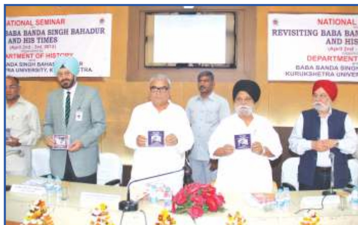
Hon'ble Chief Minister, Sh. Bhupinder Singh Hooda releasing a CD at the national seminar on Baba Banda Singh Bahadur

In its commitment to quality sustenance and enhancement, the University monitors and evaluates its strategies on improving the process of teaching-learning and evaluation. To this endeavor, mechanisms like regular feedback from students and other stakeholders like alumni, industry, academic peers, employers, community, etc. are actively practised. Internal Quality Assurance Cell (IQAC), constituted as per guidelines of NAAC and UGC, is functioning as a nodal body on the campus.