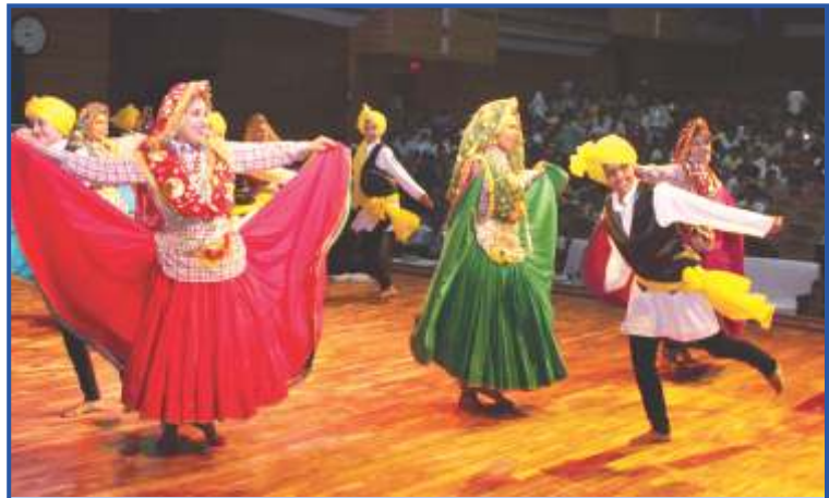
Students performing at the Haryana Day 'Ratnawali Festival'

The University has been networking with Government and NGOs, and several collaborative outreach programmes are being undertaken. The Women's Studies Research Centre organizes regular activities aimed at empowerment of women. The Centre has established Gender Sensitization Committee Against Sexual Harassment (GSCASH) and trained more than 130 batches of school teachers, health workers, police personnel, sarpanches and panches on gender sensitization. The centre regularly conducts workshops on legal literacy for women staff and students, and awareness camps on declining sex ratio and pre-natal diagnostics in different villages of Haryana.