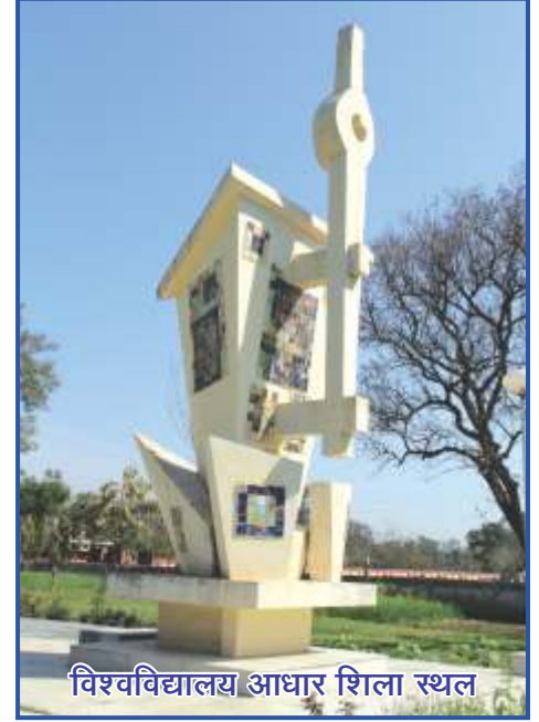
विश्वविद्यालय आधार शिला स्थल

राष्ट्रीय मूल्यांकन एवं प्रत्यायन परिषद्, बंगलौर द्वारा ए-ग्रेड में अनुदित, आज विश्वविद्यालय सुस्थित प्रतिष्ठा का उपभोग करता है तथा अन्तर्राष्ट्रीय मानकों के साथ सहमति में उत्कृष्ट शिक्षा पाने की इच्छा रखने वालों को आकर्षित करता है। विश्वविद्यालय राष्ट्र एवं राज्यों से आए विद्यार्थियों को अपनी बौद्धिक शक्ति के विकास के लिए बनाई गई सीखने एवं अनुभव की नीति के साथ साथ सामाजिक, नैतिक तथा पौराणिक मूल्यों के द्वारा विश्व स्तरीय शिक्षा प्रदान करती है। विश्वविद्यालय के लक्ष्य और उद्देश्यों का मुख्य केन्द्र बिन्दु नये ज्ञान के उत्पादन तथा सम्प्रेषण के माध्यम से शैक्षणिक उत्कृष्टता को समाज के लाभ-वंचित समुदाय की उपेक्षा न करते हुए प्राप्त करने पर केन्द्रित है। अन्वेषणात्मक विचार तथा दृष्टिकोणों का उन्मुक्त विनिमय बौद्धिक सम्वृद्धि तथा राष्ट्रीय विकास के लिए मूल संघटक चिह्नित किये गये हैं।