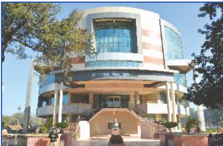
A view of Jawahar Lal Nehru Library

The University has an excellent infrastructure in terms of 425 acres of Wi-Fi campus, smart classrooms, computer labs in most of the departments, world-class teaching and research laboratories, computer centre, instrumentation centre, central and departmental libraries, hostels, canteens, auditoria, administrative blocks, examination wing, play grounds, gymnasium, Olympic size swimming pool, etc. Besides the 2500 seating Bhagwadgita Sadan, the University has several conference rooms and two other auditoriums of about 350 seats each.