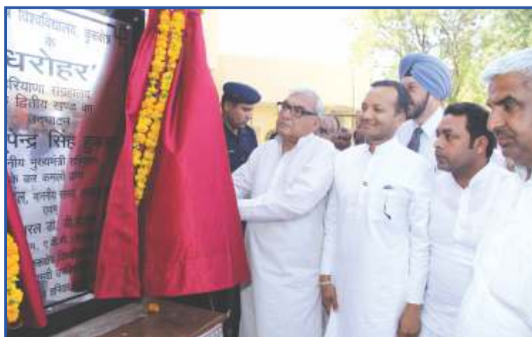
Hon'ble Chief Minister, Sh. Bhupinder Singh Hooda inaugurating the second phase of Dharohar Haryana Museum

The academic image of the University as an 'A' grade institution recognized by National Assessment and Accreditation Council got a further boost with Nielsen and India Today ranking our University in 2013 at 13th spot in its survey of 350 Universities in India. For these achievements, we are indebted to Hon'ble Governor-Chancellor for his able guidance and the Government of Haryana for its active support. I am also deeply grateful to the University's staff, students and supporters for making this possible and I hope they will continue to work to further improve the standards of the University in the future.