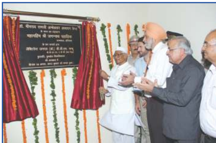
Hon'ble Governor-Chancellor, Sh. Jagannath Pahadia, inaugurating the building of Dr. B.R. Ambedkar Studies Centre

Accredited with an 'A' grade by National Assessment and Accreditation Council, Bangalore, the University today enjoys a sound reputation and is eagerly sought by seekers of quality education in conformity with international standards. The University offers students from throughout the region, state and nation a world-class education by providing learning experience designed to develop intellectual abilities, as well as, social moral and ethical values. The major focus of the University's goal and objectives is on achieving academic excellence through generation and dissemination of new knowledge without losing sight of the