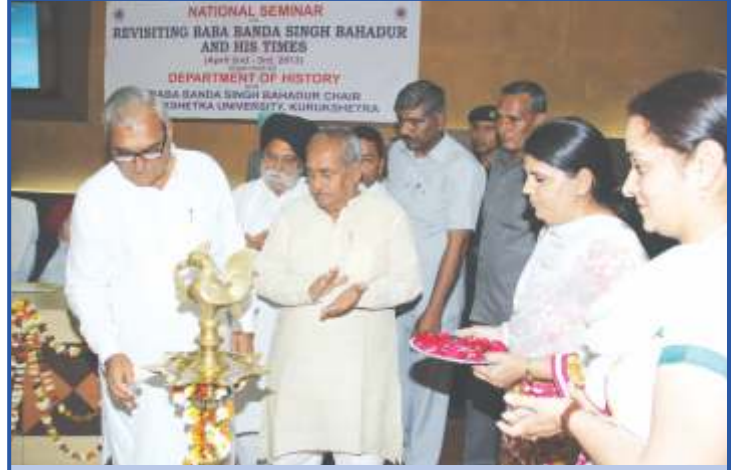
माननीय मुख्यमंत्री श्री भुपेन्द्र सिंह हुड्डा सेमिनार के दौरान दीप प्रज्वलित करते हुए

एजेन्सियों यथा डीएसटी, यूजीसी, डीआरडीओ, डीबीटी,यूनडीपी, विश्व बैंक टीईक्यूआईपी आदि से विभिन्न स्कीमों के अधीन बड़ी धनराशियां लाने में सफल हो चुके हैं। एफआईएसटी, एसएपी तथा टीईक्यूआईपी से विश्वविद्यालय में विभागों की संख्या भी 12 तक है। विश्वविद्यालय के भू-भौतिकी विभाग को डी.एस.टी. स्कीम के तहत एफ.आई.एस.टी. कार्यक्रम के लिए 2.45 करोड़ रुपये की राशि प्राप्त हुई है। विश्वविद्यालय के इलैक्ट्रॉनिक साईंस एवं इन्स्ट्रुमेंटेशन विभागों को टीईक्यूआईपी के तहत वर्ल्ड बैंक द्वारा अनुदान राशि प्राप्त हुई। यूनिवर्सिटी इन्स्टीच्यूट ऑफ इंजीनियरिंग एवं टेक्नोलोजी विभाग को टीईक्यूआईपी स्कीम के तहत अनुदान प्राप्त हुआ।