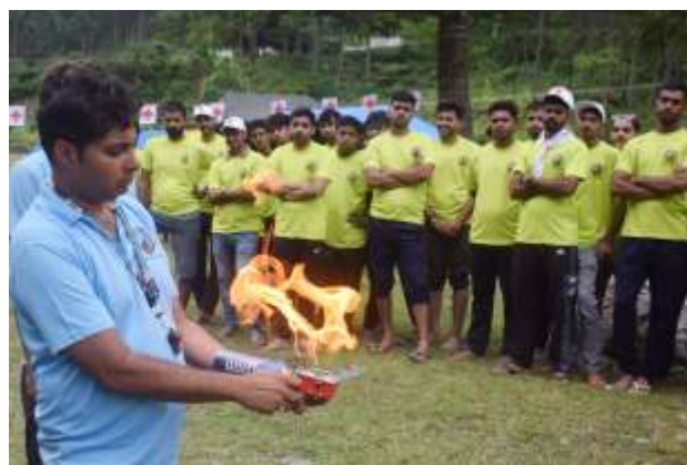
Trainer Teaching Fire Safety Technic in the YRC Adventure Camp from 15th to 21st September, 2022