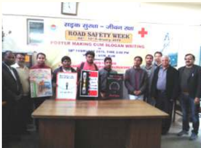
Poster making -cum- Slogan writing on Road Safety

Youth Red Cross, KU has organized a counseling/awareness competition for its students as a part of celebration of International Day against Drug Abuse & Illicit Trafficking from 26th June to 10th July, 2020.