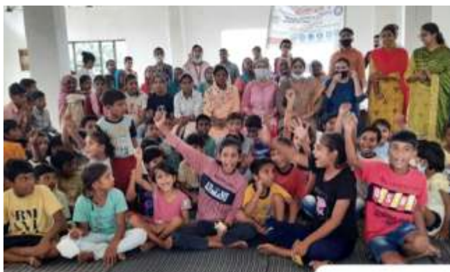
Nutrition, Immunity and Health camp organized at Dayalpur on 23 September, 2023

The Seven days NSS Camp was organized by NSS (UTD) on the theme "Azadi Ka Amrit Mahotsav" held from November, 09 to 15, 2021.