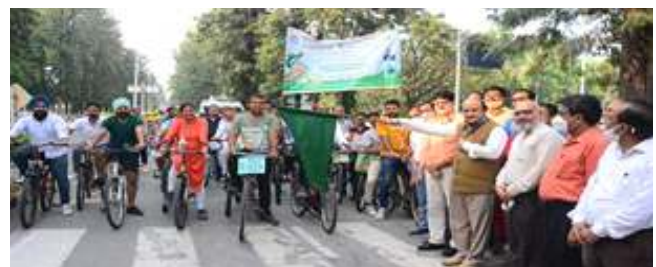
Cycle Rally organized by the Eco-club on 17th August, 2021 to spread of awareness about cleanliness and to save environment