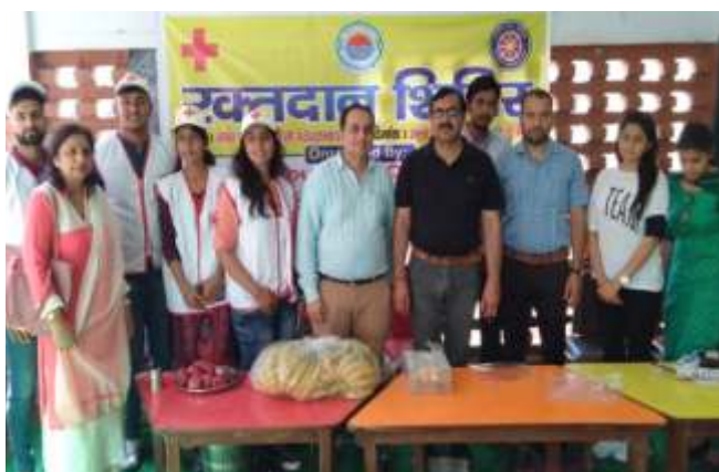
Blood Donation camp in Pabnawa village (adopted village) 28th March, 2019

On the observation of 30th National Road Safety Week 2019 from 4th to 10th Feb, 2019, Youth Red Cross UTD Kurukshetra University, Kurukshetra in association with Road Safety Club, K.U.K. organized an awareness rally on 09.02.2019 in which around 200 students from various Departments participated.