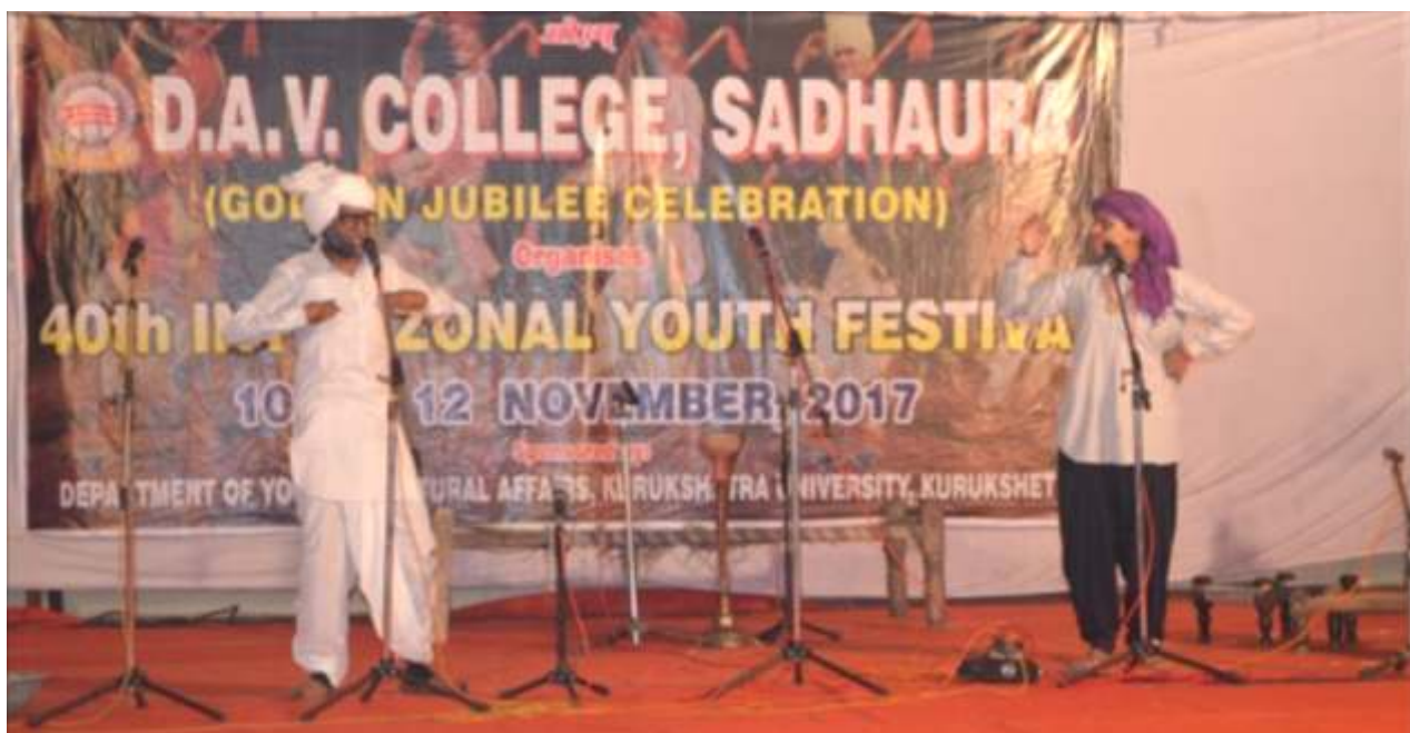
Students performing in Inter-Zonal Youth Festival 2017 held at DAV College Sadhora (Yamunanagar) 11