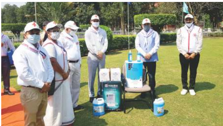
Distribution of Automatic Sanitizer Dispensers on World Red Cross day i.e. 8 May, 2021