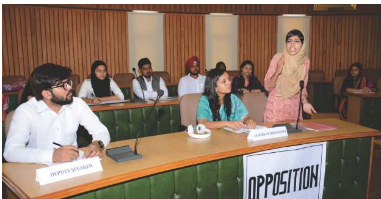
National Youth Parliament Competition held at Faculty Lounge, KUK