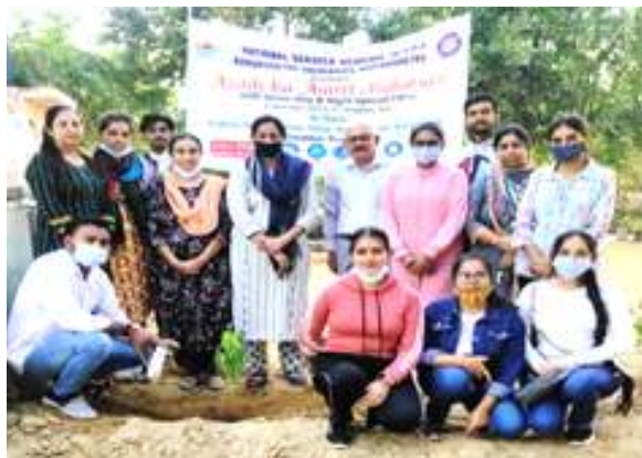
Tree Plantation by Dean Academic Affairs during Seven Day Camp