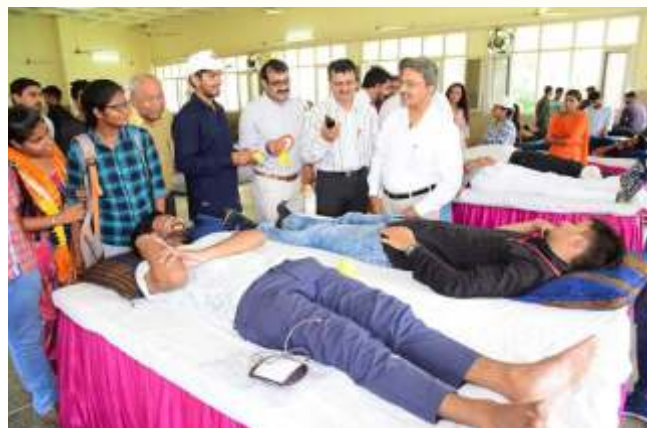
Blood Donation Camp organised in Community Centre, KUK on 26 th September, 2019