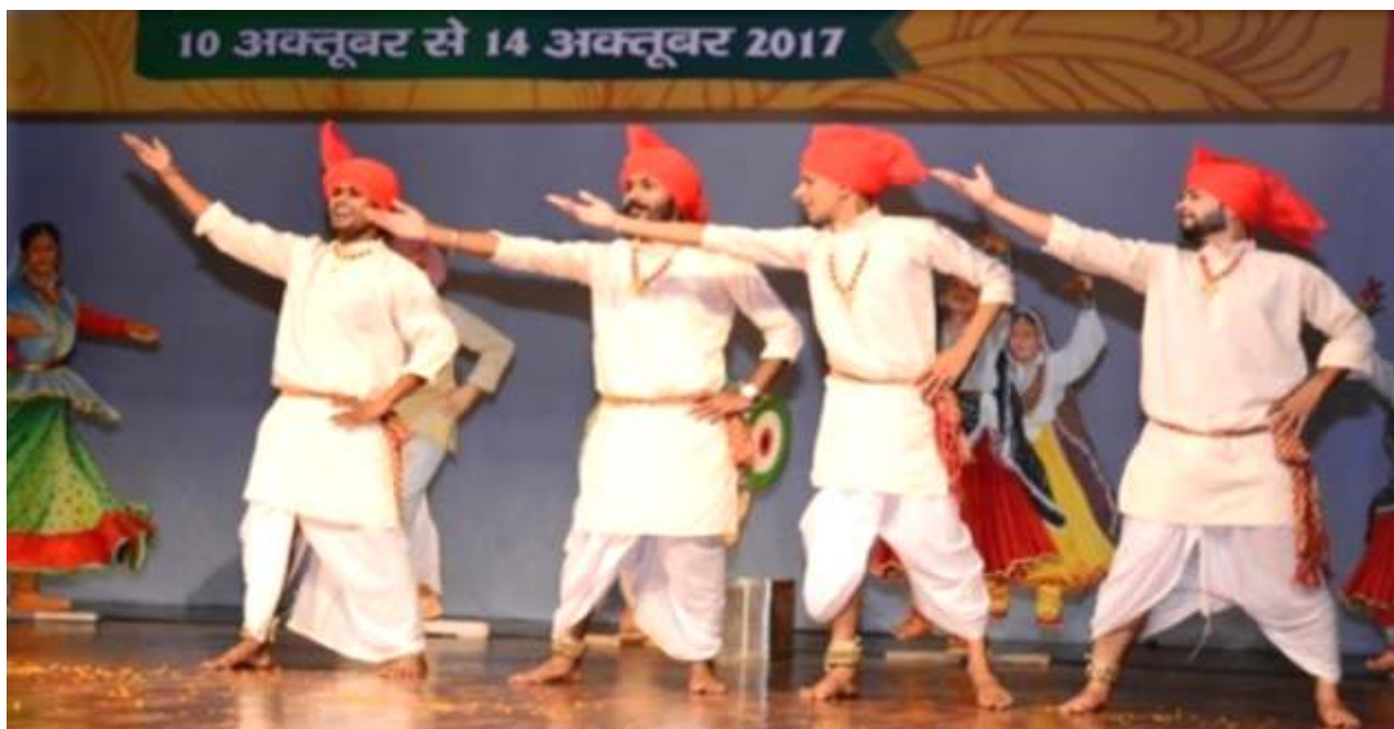
Students participating in Ratnawali Competition -2017 organized at Kurukshetra University, Kurukshetra

Ratnawali 2017 (State Level Youth Festival) was celebrated at Kurukshetra University, Kurukshetra from 10th October to 14th October 2017 with a team of 88 students. UTD students participated in 31 different cultural events i.e. (music, dance & theatre etc.) and scored 1st position in 4 events viz Haryanvi Skit, (Best actress in skit), on the spot painting competition, Short Movie, Haryanvi Folk Instrumental solo; got 2nd position in 4 events viz Exhibition of painting, best actor, Solo dance male, Folk costume male & several 3rd and 4th positions.