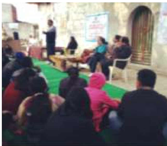
Seven Day Camp was organized on the theme "DIGITAL INDIA" at village Mirzapur from March 02-08, 2017