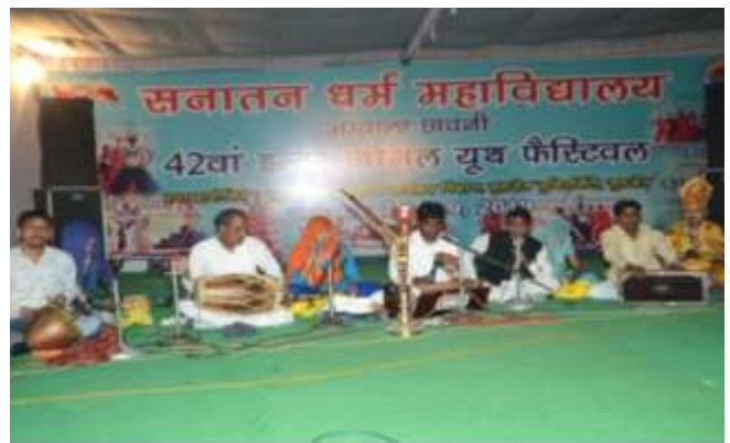
Students participating in Inter-Zonal Youth Festival

Inter-Zonal Youth Festival: - Inter-Zonal Youth Festival-2019 was held at Sanatan Dharma College, Ambala Cantt. from 7th to 9th November, 2019. UTD students participated in 29 different events. Our students secured 1st commendation in 04 events and 2nd Commendation in 08 events.