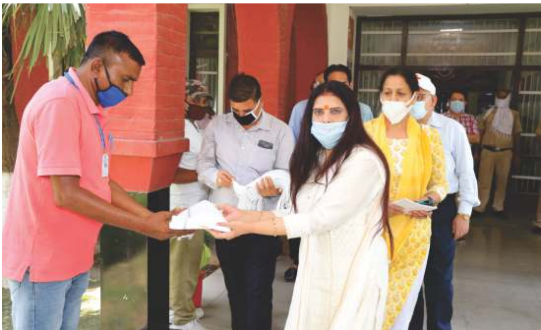
Gamcha distribution by the Vice-Chancellor to the security persons

Gamchas and masks were distributed out of Youth Red Cross (Colleges) funds among the beneficiaries to keep themselves safe in the day to day working conditions in the campus. In the same event, remaining 635 gamchas were distributed to security persons, malis, sanitation staff and other persons involved in essential services of the University.