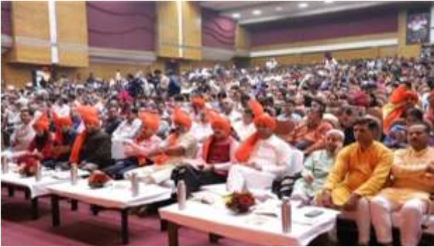
Dignitaries at Ratnawali Festival-2018 held from 26 - 29 October, 2018