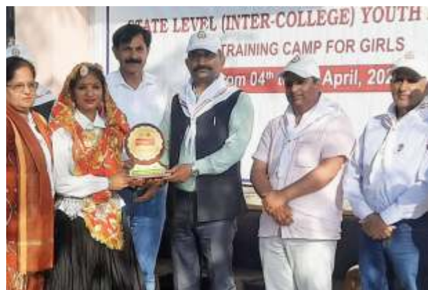
State Level Youth Red Cross Training Camp for Girls from 4th to 10th April, 2022