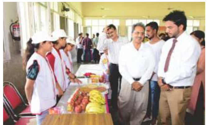
NSS (UTD) in collaboration with YRC, KUK organized blood donation camp on September 26, 2019