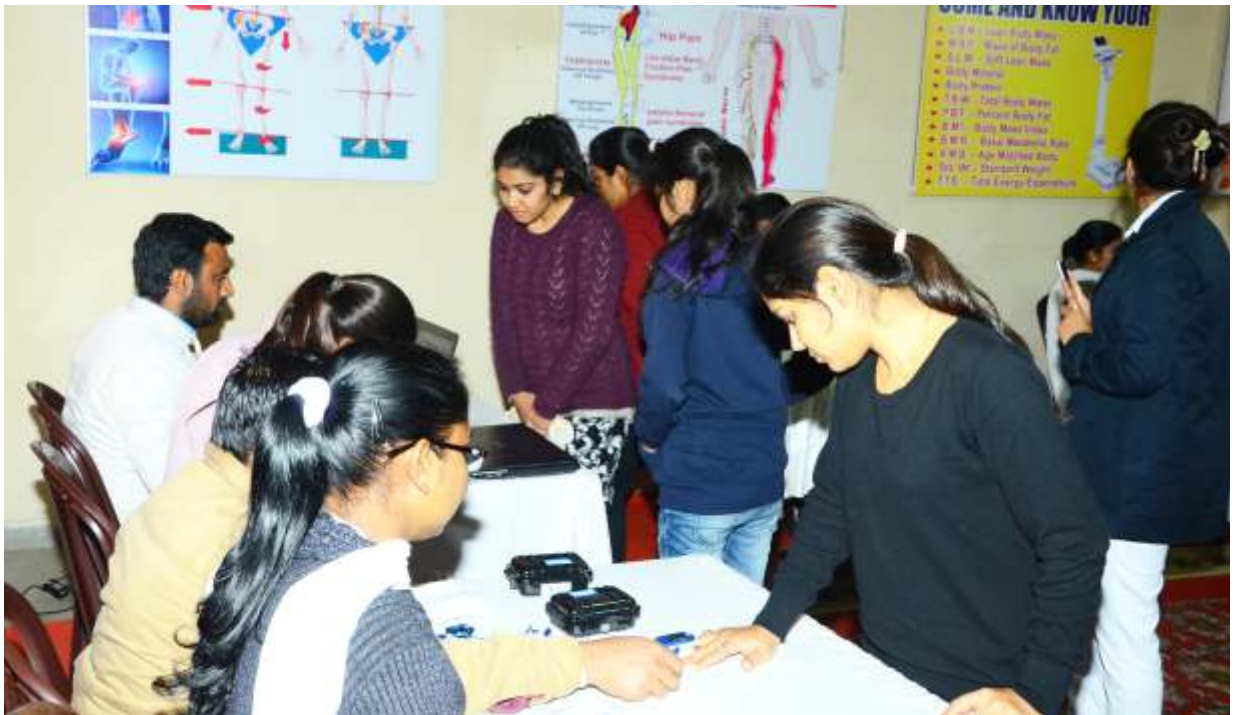
Swarn Jayanti Health Awareness Camp for Girls titled as 'शिक्षित नहीं स्वस्थ बेटी' from 18-20 Jan, 2017