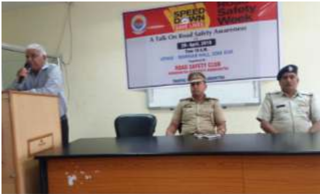
Awareness programme organized at University School of Management by YRC