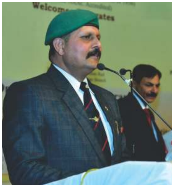
An Officer from Haryana State Narcotics Control Bureau addressing about Drug Abuse and Illicit Trafficking on 27-12-2021