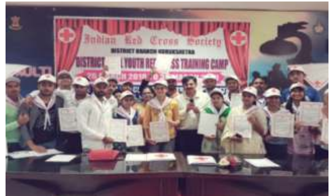
Five Day district level youth Red Cross Training Camp was organized by Indian Red Cross Society, District Kurukshetra from 26 March, 2018 to 30 March, 2018