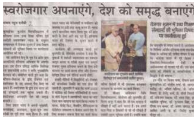
Workshop on "Role of Higher Education Institutions in Employment Creation" under Aatm Nirbhar Haryana Mission on November 13, 2021