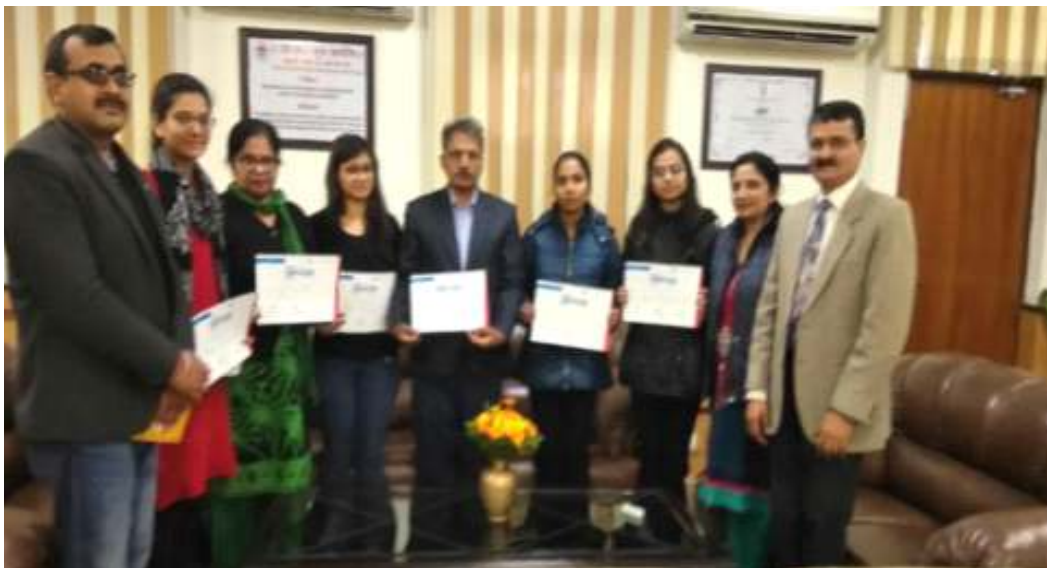
Six YRC volunteers participated at National Youth Fest at New Delhi by Indian Red Cross Society from 12th to 14th Feb., 2018.