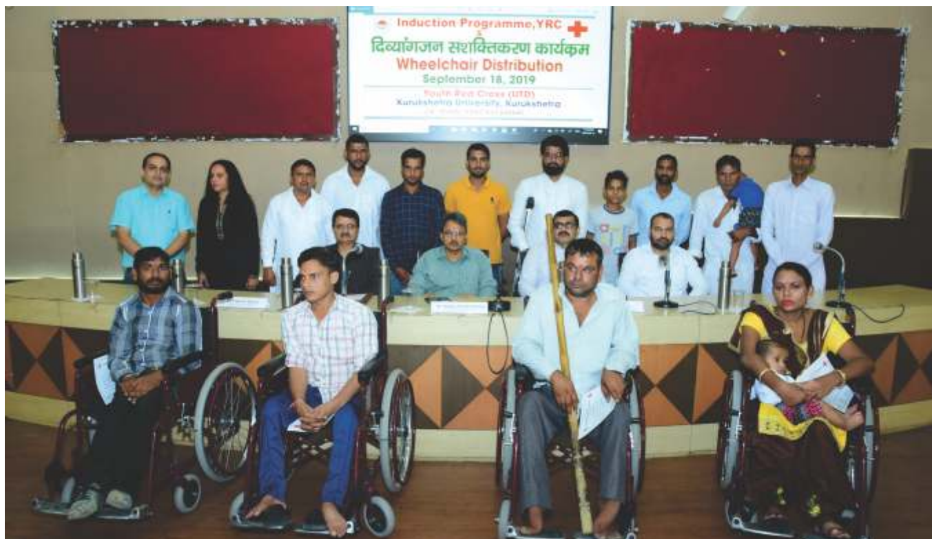
Wheelchair distribution at Divyangjan Shasktikaran Programme on 18th Sept. 2019