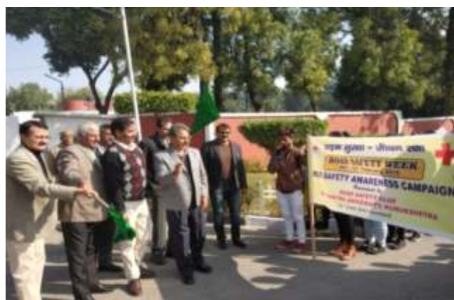
Flag off by Hon'ble Vice-Chancellor to start the awareness rally on 09.02.2019