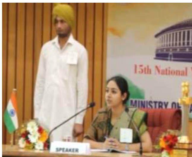
Pics of students while participating in the 15th NYPC