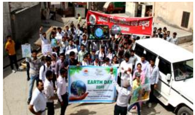
Earth Day celebration on 22 April, 2022 with the village community & Pabnawa school students by the students and faculty members of Geology Department. School students were awarded and motivated through various activities.