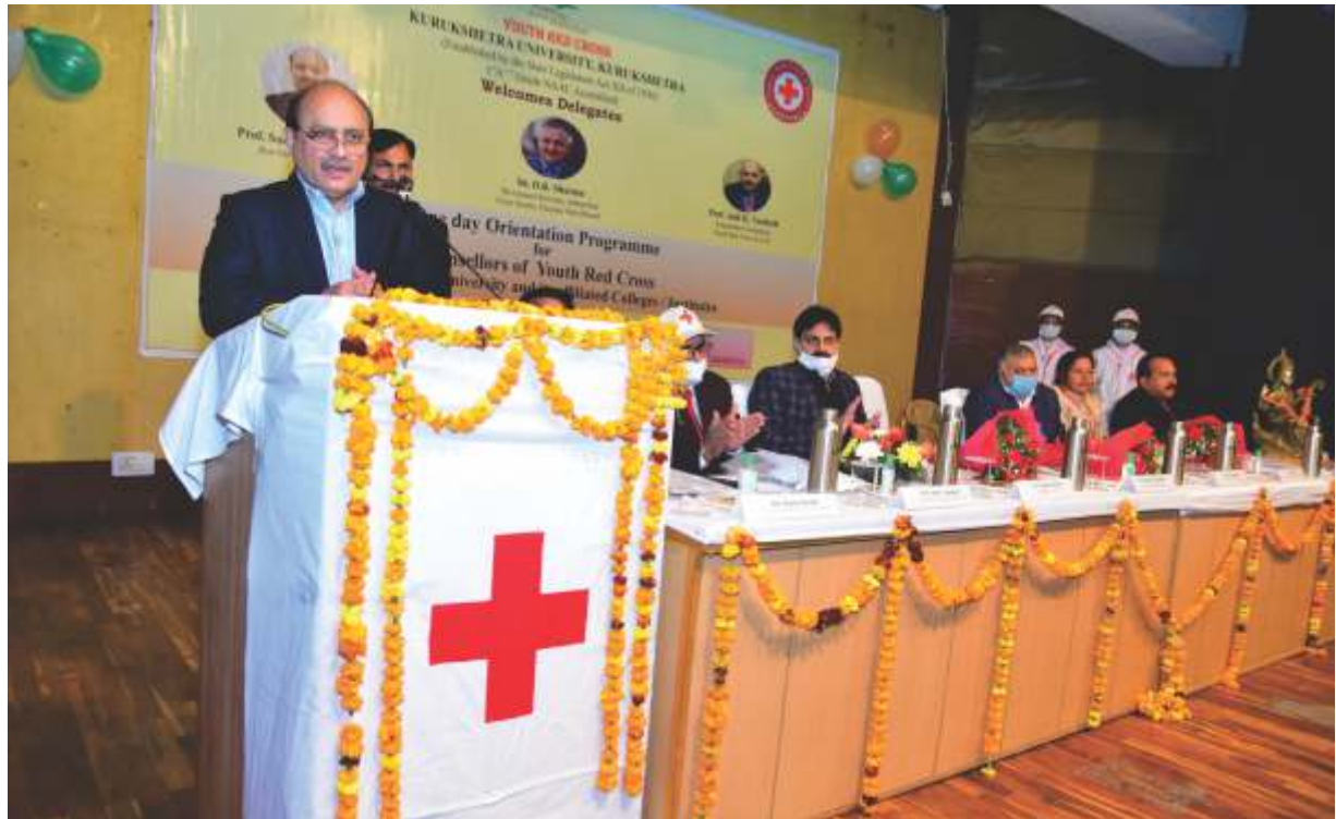
Hon'ble Vice Chancellor addressing the YRC Counsellors during One Day Orientation Programme on 27-12-2021