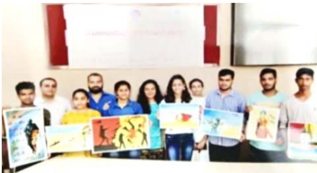
Painting competition organised on Surgical Strike Day