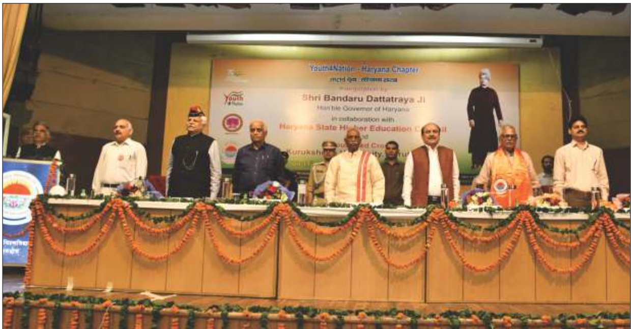
Glimpse of "Youth for Nation" Programme