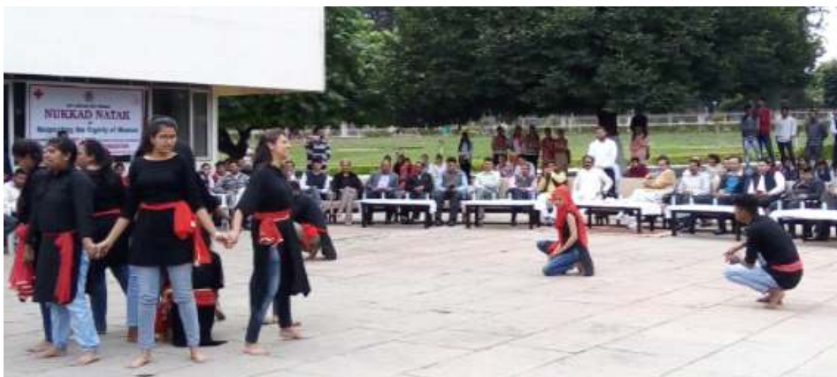
Volunteers performing Nukkad Natak on the theme 'Beti Bachhao, Beti Padhao'