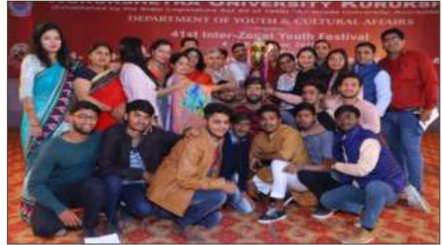
Students after winning trophy in the Inter-Zonal Youth Festival