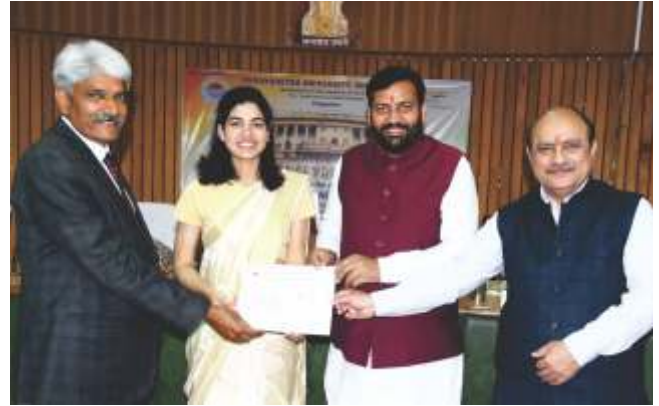
16th National Youth Parliament Group Level Competition organized by the Kurukshetra University, Kurukshetra on 11.03.2022