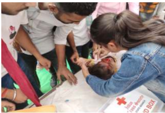
First Aid Post at Ratnawali Festival held from 2nd to 5th Nov. 2019

The volunteers of Youth Red Cross Participated in State level Training Camp for Girls at Haridwar from 1st to 6th Nov., 2019.