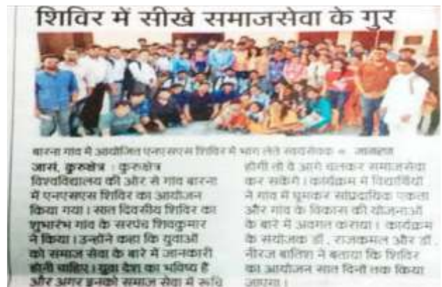
Volunteers alongwith Programme Officers, NSS organized a number of activities during seven days camp