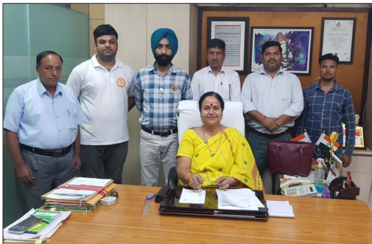
Dedicated Staff Members of Dean Students' Welfare Office