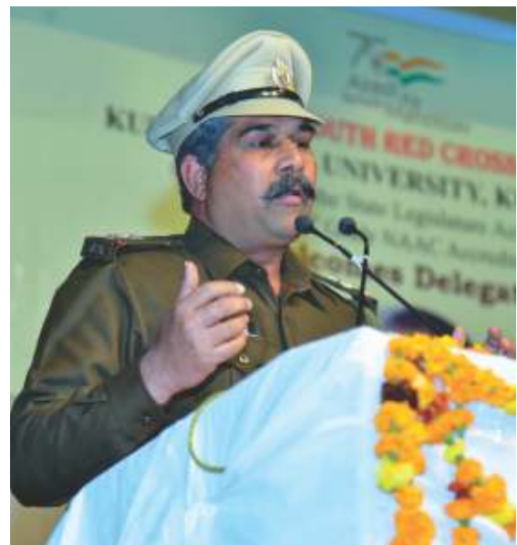
Resource person addressing the counsellors about Blood Donation on 27-12-2021