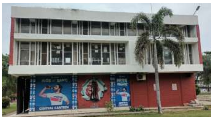
Subhash Sadan (Students' Home)

Subhash Sadan (Students' Home) is maintained for providing a venue for get-together and other programmes of students of University Teaching Departments. Students' Home is also provided to the students for such diverse programmes of discussions and other cultural events etc. Other University venues i.e. Community Centre, R. K. Sadan etc. are also provided to the students, if need arises.