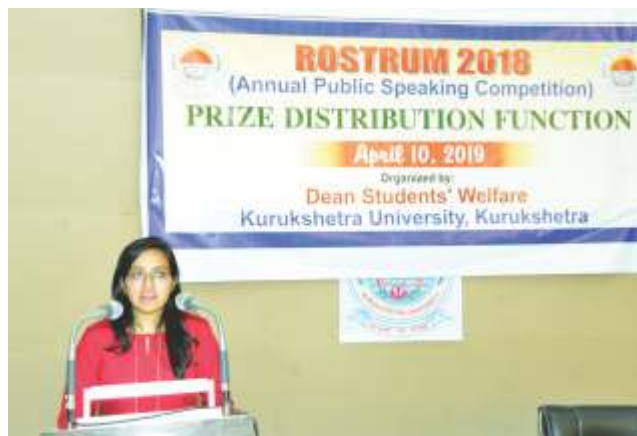
Prize Distribution Function Rostrum-2018 held on April 2019