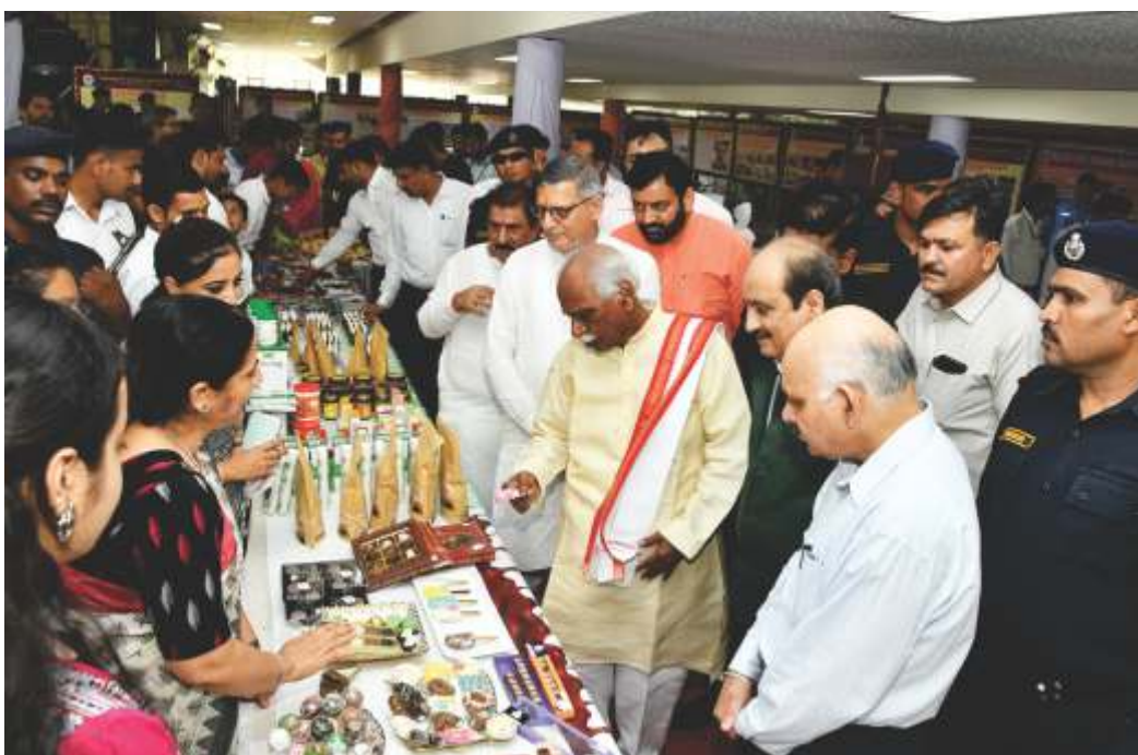
DSW briefing about the presentations during the exhibition