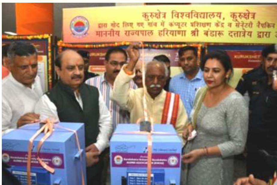
02 Sanitary napkin incinerators were distributed by Hon'ble Governor of Haryana for the G. S. S. School, Pabnawa on 22.8.2022.