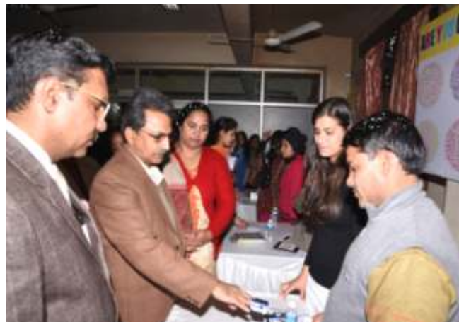
Five Days camp for First Aid Training was organized at Multi Art Cultural Centre, Kurukshetra