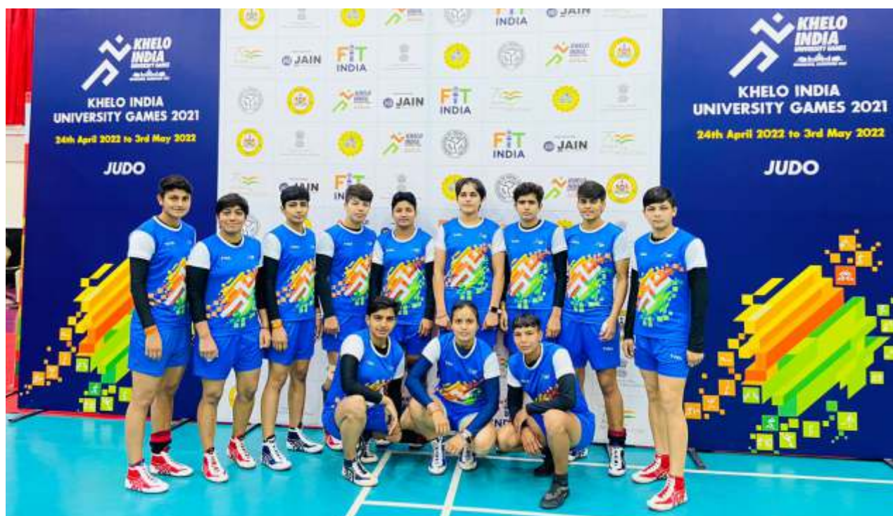
Khelo India University Games held from 24-04-2022 to 03-05-2022