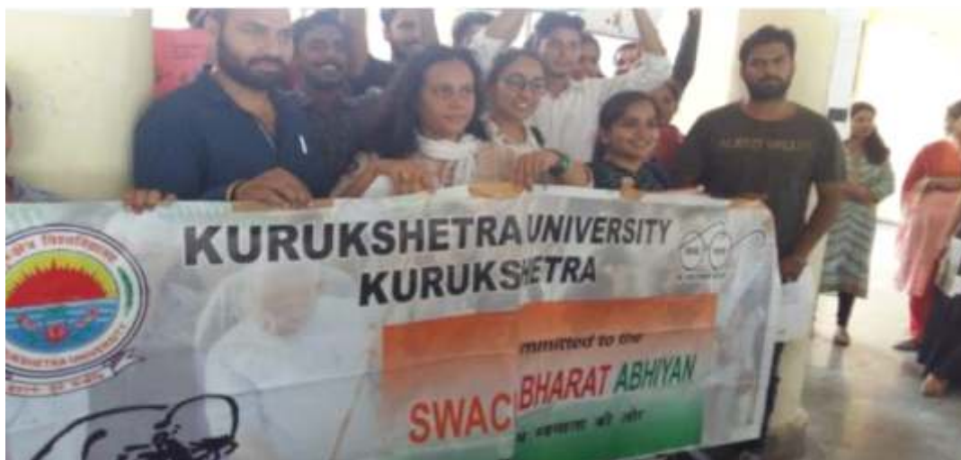
UTD Volunteers observed "Swachhta Abhiyaan"

In addition to this the NSS UTD KU Kurukshetra regularly organizes "Swachhta Abhiyaan" on 26th of every month and observes "Vehicle Free Day" on second Tuesday of every month.