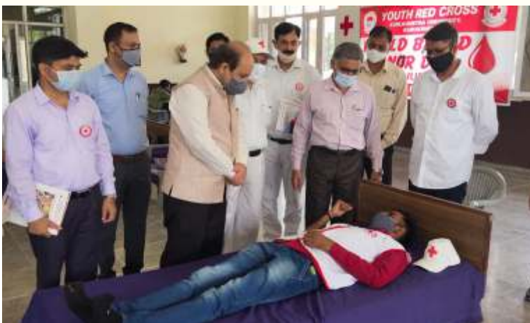
Blood Donation Camps at University Campus