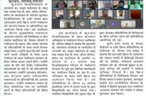
News Coverage regarding online Eco Quiz "Know your Environment"