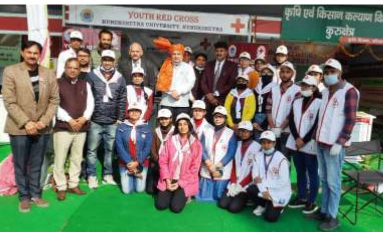
First Aid Post during Gita Mahotsav from 02 to 19-12-2021