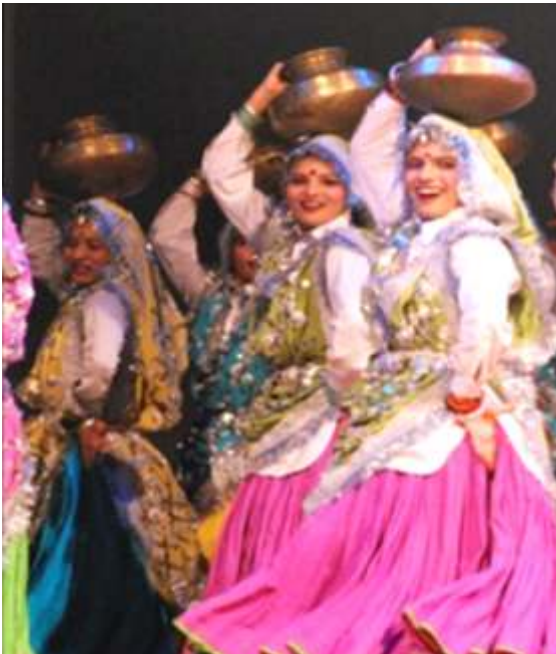
Glimpse of Ratnawali

Ratnawali - Haryana Day Festival: - Ratnawali-2018 (Haryana Day Festival) was celebrated at Kurukshetra University, Kurukshetra from 2nd to 5th November, 2019. UTD students participated in 30 different cultural events i.e. (Fine Arts, Literary, Music, Dance & Theater etc.) and scored 1st position in 03 events viz Poetry, On the spot painting and Exhibition of Painting; got 2nd position in 03 events viz Haryanavi Declamation Contest, On the Spot Painting, One-Act Play; several 3rd, 4th and 5th positions were also secured by the students of UTD.