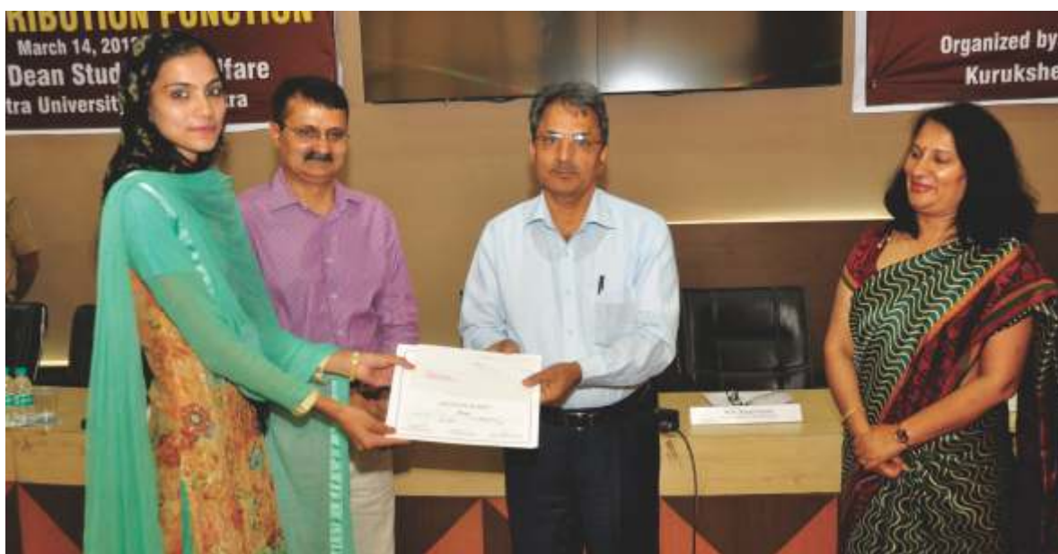
Prize distribution function of Rostrum-2016