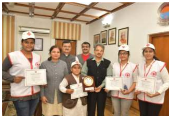
Volunteers participated in State level Training Camp for Girls at Haridwar from 1st to 6th Nov., 2019