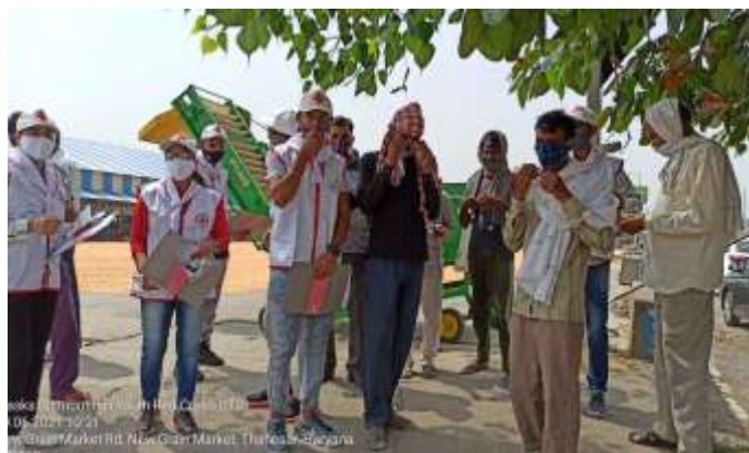
YRC Volunteers Distributing mask during COVID-19 41