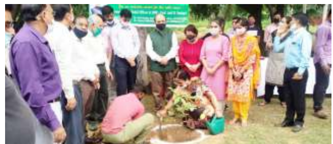
"Tree plantation drive" organized by the Eco-club and the horticulture department on 20th August, 2021