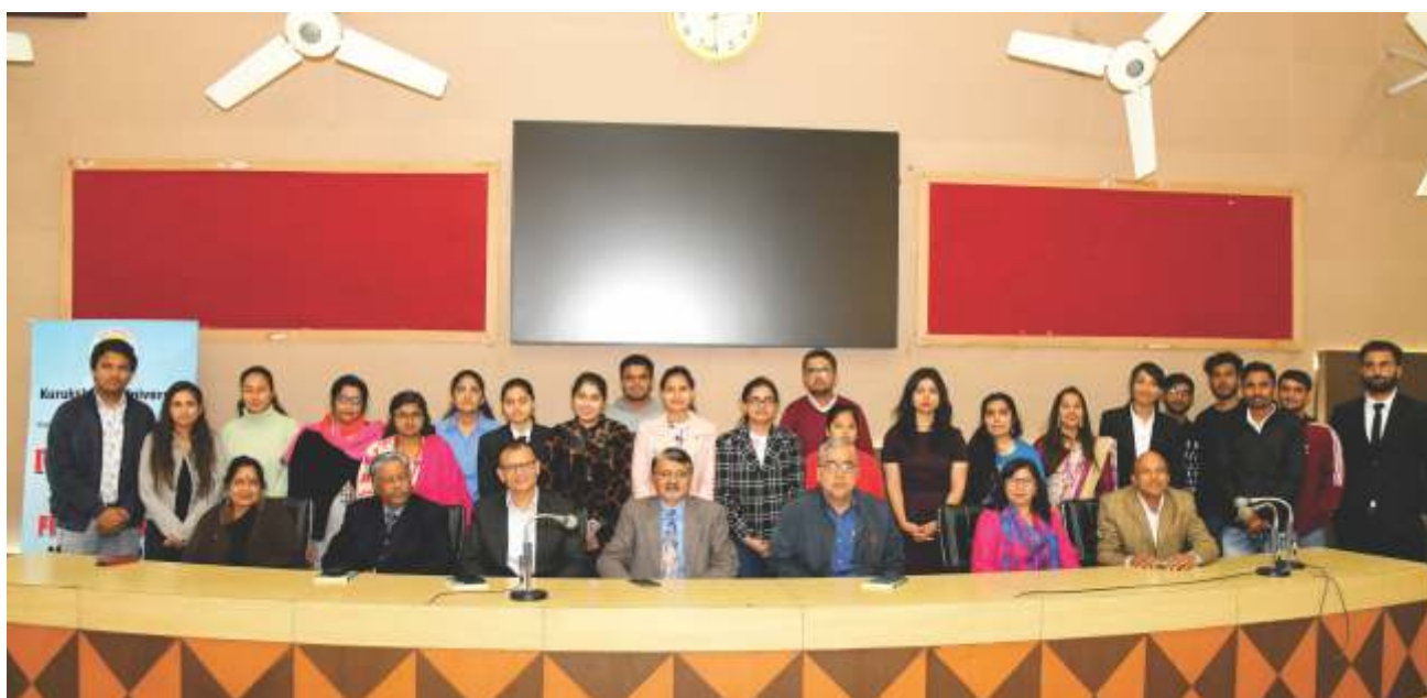
Final Round of Rostrum Competition held on 7th March, 2020