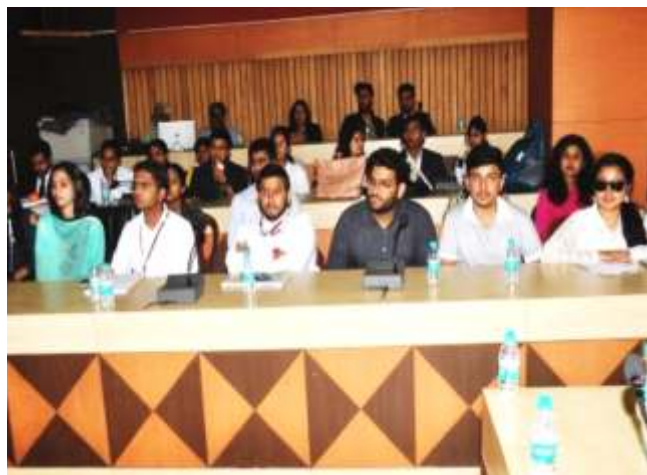
Prize Distribution Function of Rostrum-2017