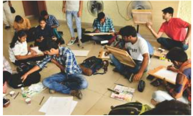
Activities held on the occasion of Jal Shakti Abhiyan