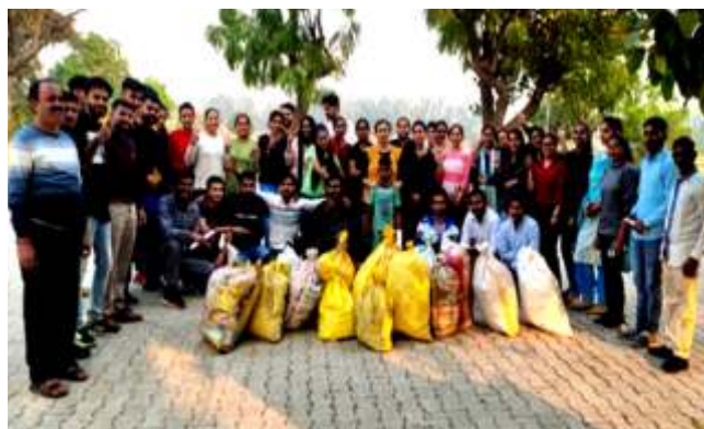
Plastic waste collected by the volunteers from streets, common gathering places and from the vicinity of ponds of the village