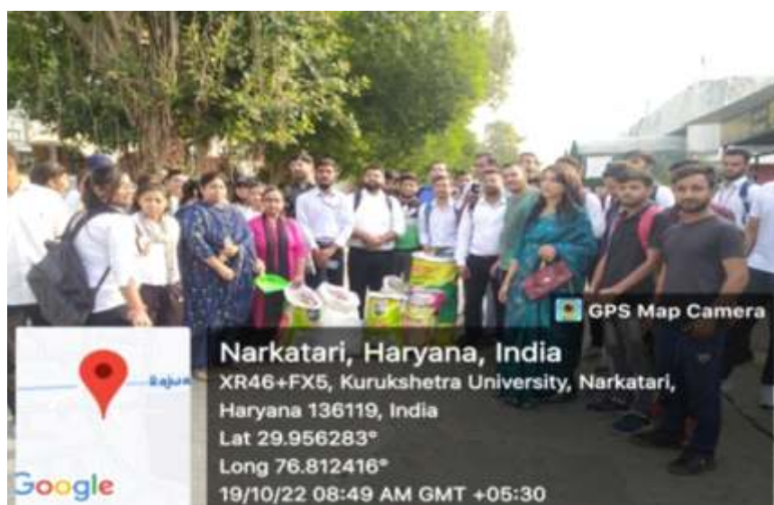
NSS (UTD) volunteers during cleanliness campaign in the University market area on 19-10-2022