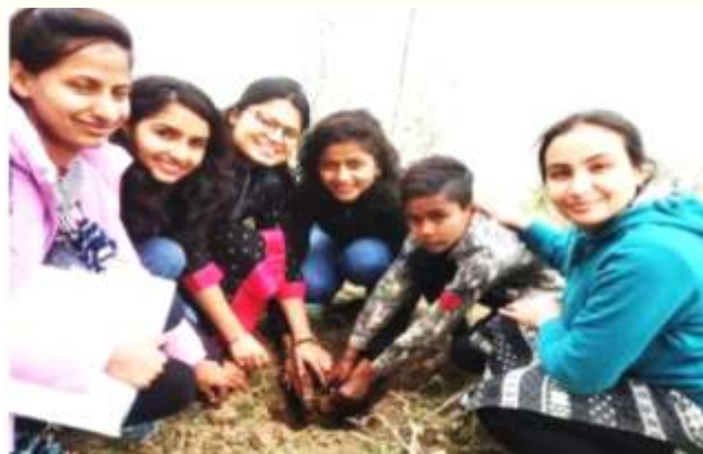
Volunteers participating in tree plantation drive and motivating the villagers